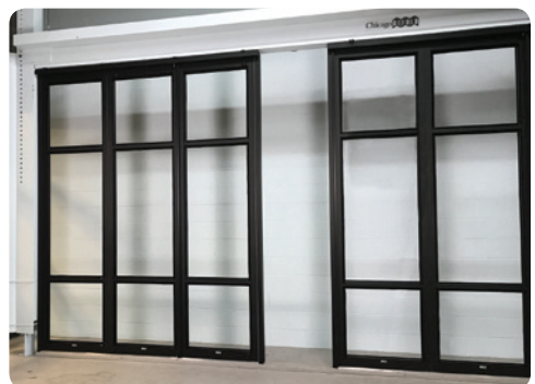
See our bifolds in action at: youtube.com/chicagobifold